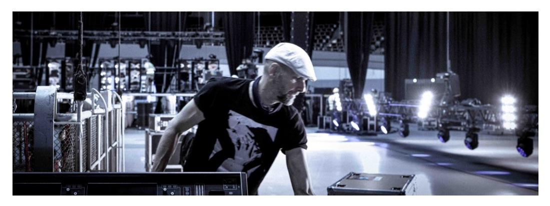
Evolution Wireless Digital

New professional charging option and the latest software updates